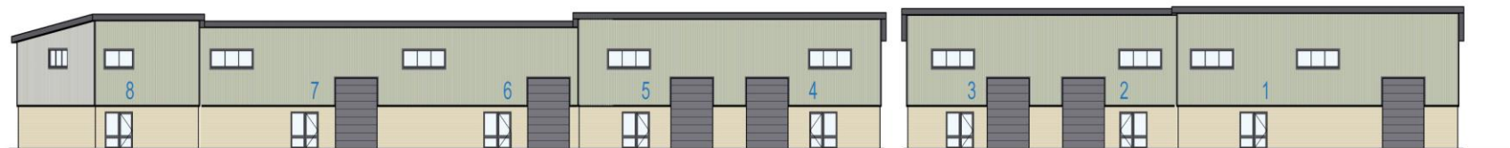
Illustration only – Not to scale