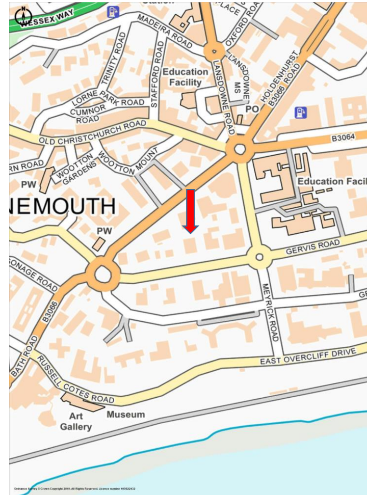
Promap v2 LANDMARK INFORMATION Printed Scale - 1:5000, Paper Size - A4

THESE DETAILS ARE SET OUT AS A GENERAL OUTLINE FOR GUIDANCE PURPOSES AND DO NOT FORM PART OF AN OFFER OR A CONTRACT. IT IS ESSENTIAL THAT APPLICANTS MAKE THEIR OWN ENQUIRIES REGARDING THE CONDITION OF THE PROPERTY, PLANNING PERMISSION, BUILDING CONTROL, UTILITIES SUPPLIES AND RATES LIABILITY. QUOTED RENTS AND PRICES EXCLUDE VAT (WHERE APPLICABLE). WE HAVE NOT UNDERTAKEN A BUILDING SURVEY NOR TESTED ANY EQUIPMENT, FIXTURES & FITTINGS OR SERVICES SO WE CANNOT VERIFY THAT THEY ARE IN WORKING ORDER AND HAVE APPROPRIATE STATUTORY CONSENTS. INTERESTED PARTIES SHOULD SEEK VERIFICATION VIA THEIR SOLICITOR OR SURVEYOR. SUBJECT TO CONTRACT.